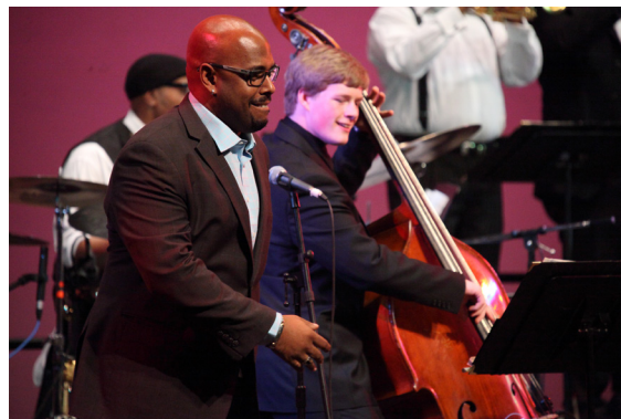
Grammy Award winning bassist Christian McBride

Many of our students choose to take summer school in order to fit in all the amazing electives New Trier offers. Read the article Summer School Succeeds on the opposite side of this sheet from New Trier's sophomore student newspaper, "The Journal" to hear the student perspective on why so many take advantage of this opportunity.