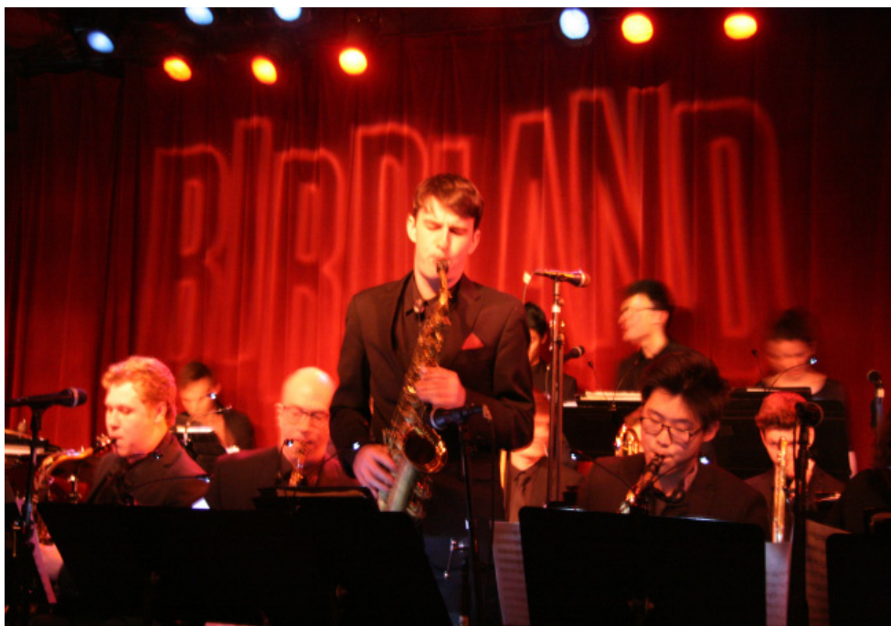
Jazz Ensemble 1 performs at Birdland in New York City during their 2017 spring break trip.