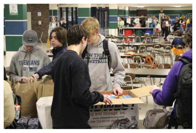
Northfield Pep Club often organizes an annual toiletry drive for Chicago-area organizations such as the Northfield Food Pantry and Hines Veteran Hospital.